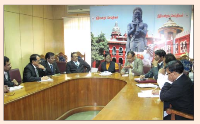
Jharkhand Judicial Officers