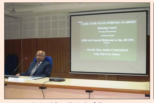
Lecture delivered by Justice C. Nagappan