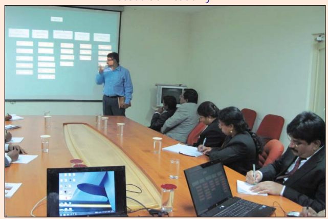
Field Visit by the Newly Recruited District Judges during their Training Programme