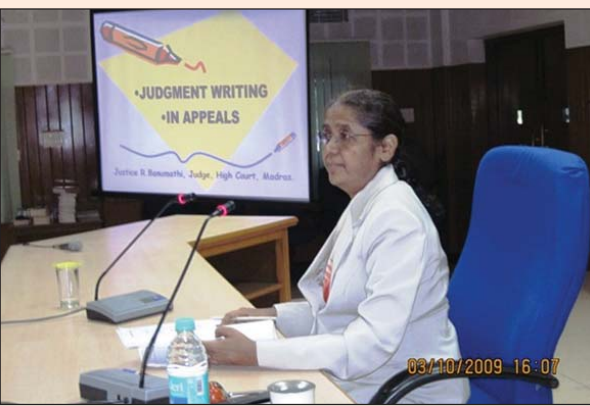
Lecture delivered by Justice R.Banumathi