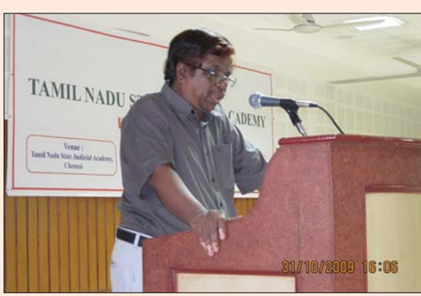
Lecture delivered by Justice K.Chandru