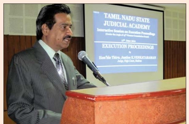
Lecture delivered by Justice K. Venkataraman