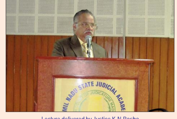
Lecture delivered by Justice K.N.Basha