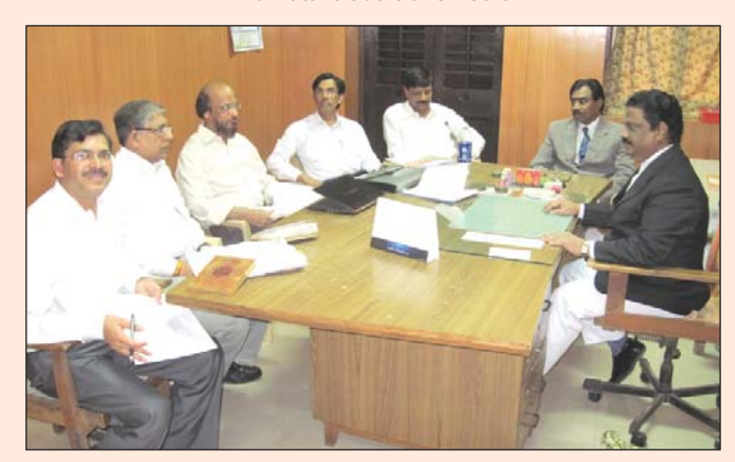
JOTRI, Madhya Pradesh Judicial Officers